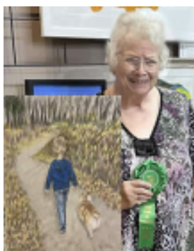
Honorable Mention Patsy Renz Color Pencil Painting “Let’s Explore”