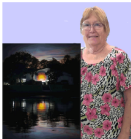
Special Honorable Mention: Martha Hickey's photograph of park at night!