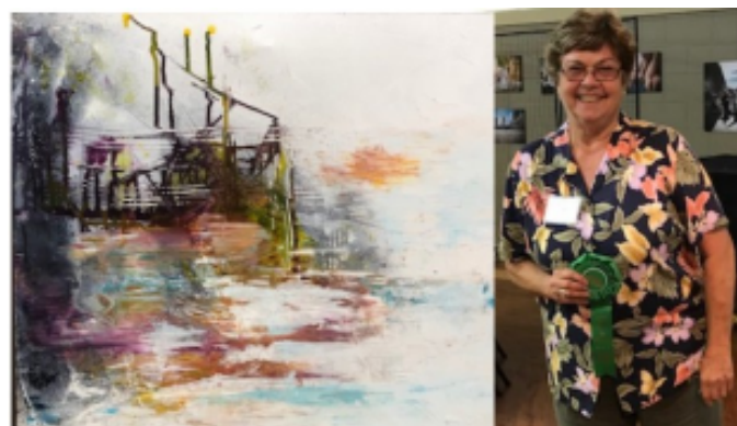
Honorable Mention - Pat Miller - Interesting composition with unusual texture that makes the painting special.