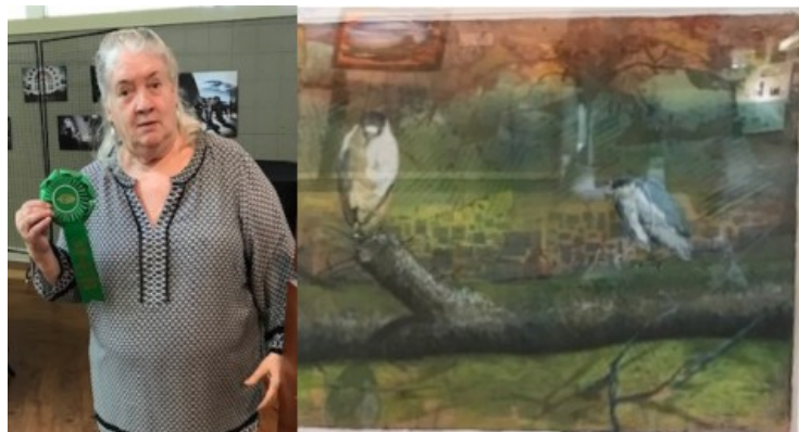
Honorable Mention - Nancy Rhoads - Love textures in water color background.