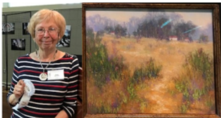
3rd Place - Kathy Detrano - Love the soft beautiful colors. One nice center of interest and direction into painting.